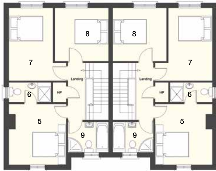
Ground Floor Option B